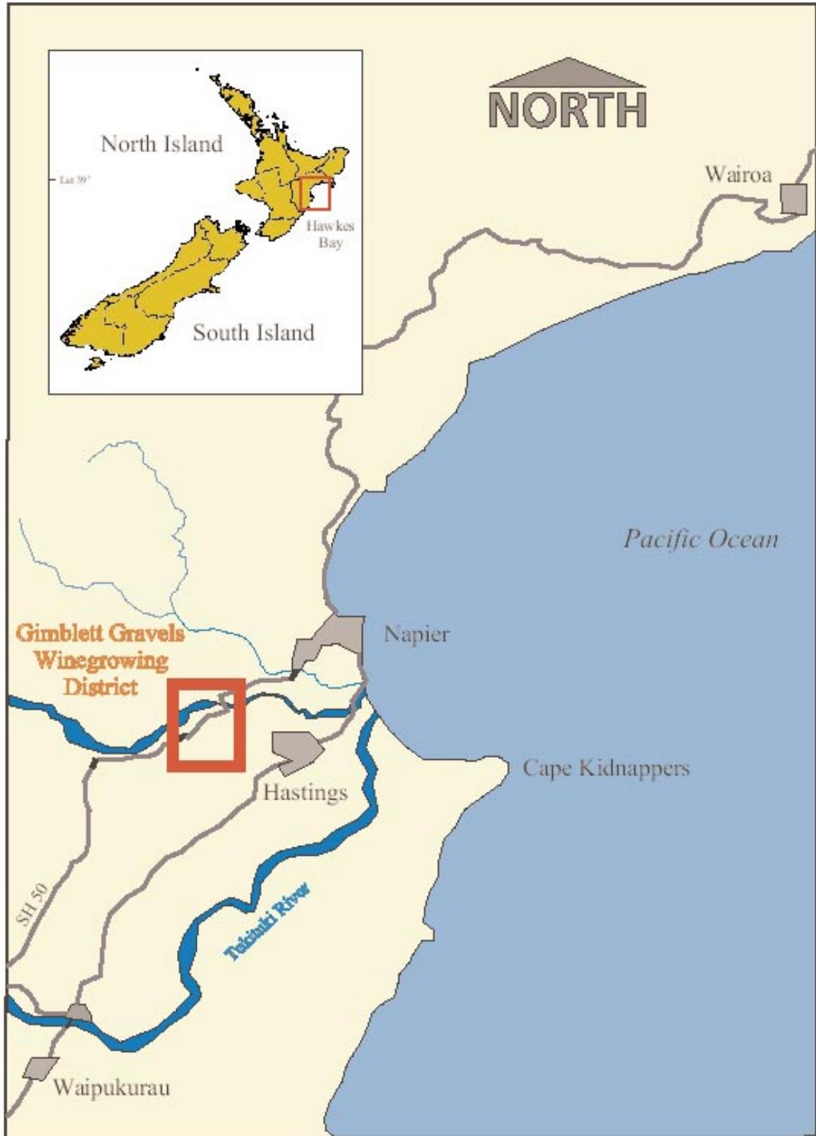
Location map - Gimblett Gravels Winegrowing District